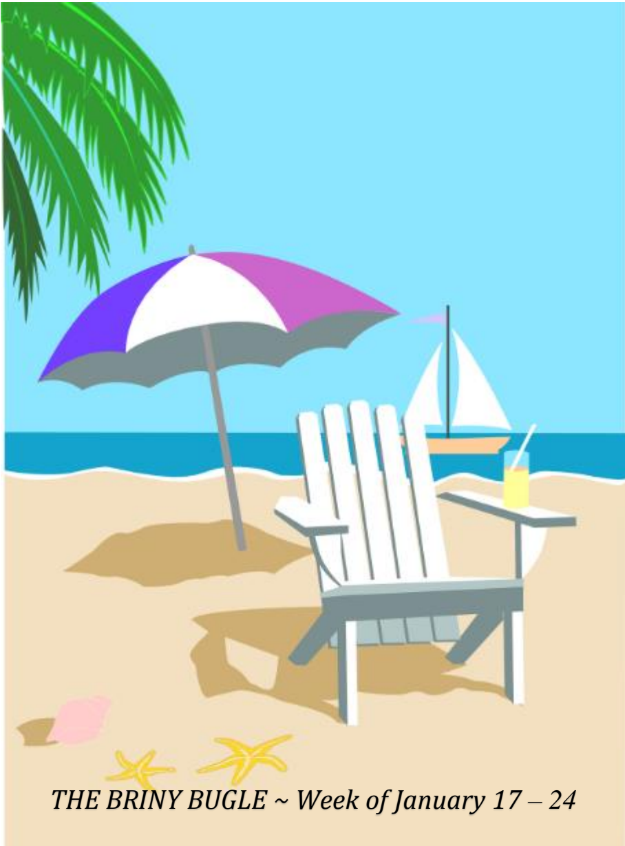
THE BRINY BUGLE ~ Week of January 17 – 24